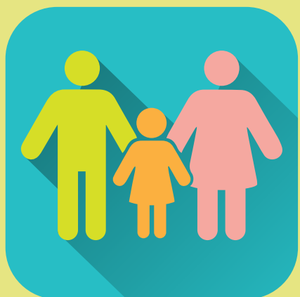
A FAMILY HISTORY OF OTHER CANCERS