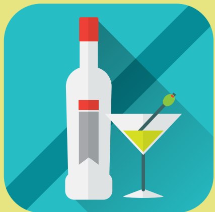
HEAVY ALCOHOL USE