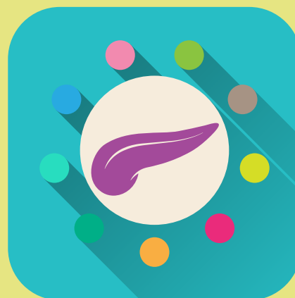
FAMILY HISTORY OF PANCREATIC CANCER