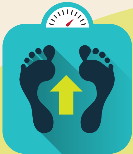
POOR DIET AND BEING OVERWEIGHT